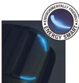
"ENERGY SMART" Management system for zero power consumption in Stand-by mode