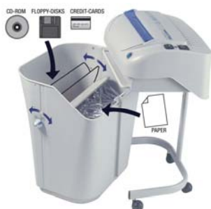
Removable waste bin with a special mechanism to separate shredded paper from plastic shreds of credit cards, CD-Rom and Floppy-Disks